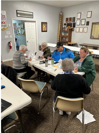
VOD & Patriot Pen voting.

to support, and attend more activities that celebrate our veterans. MORE parade attendance is a MUST!