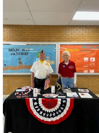
Mount Ogden Jr. High School.