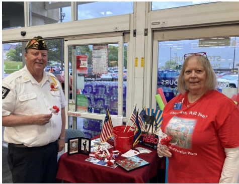
Distributing Buddy Poppies is always such a special time. Seeing the kids and adults eyes light up when taking a poppy is priceless! The stories told are always my favorite and it's always such a learning experience.