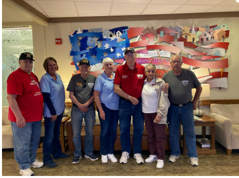
National Day of Service May 4, 2024. VFW members had a great time being BINGO buddies at George E. Wahlen Veterans Home.