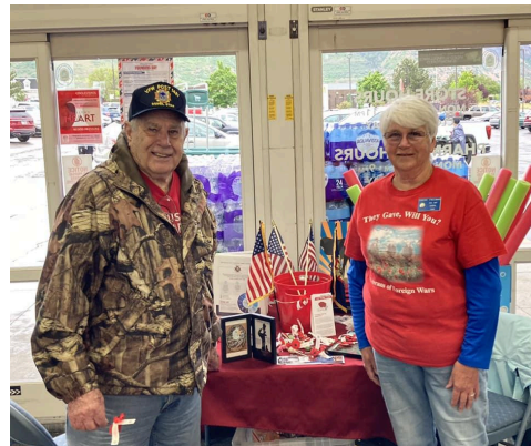
Just a few of our VFW Post 1481 family.