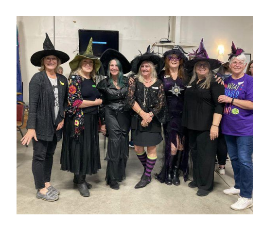
"There's a little witch in all of us."