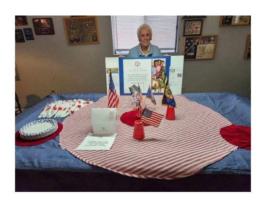
WE JUST LOVE THAT SMILE!