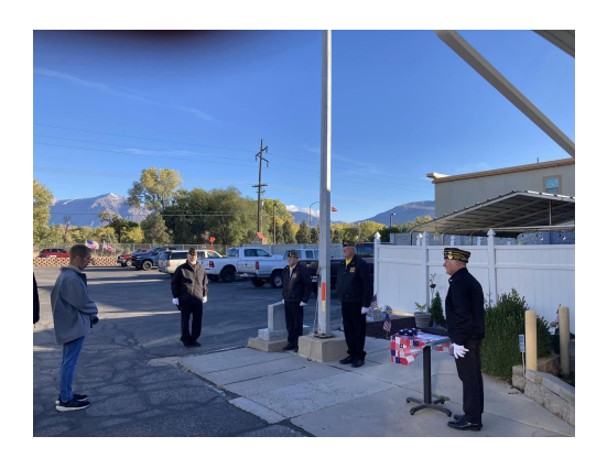
Flag retirement ceremony with Scout Troop 1481, Honor Guard, and the Auxiliary.