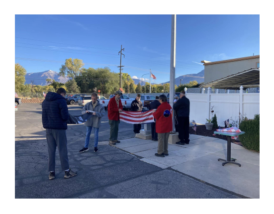
This is always such a special ceremony and the scouts do such an amazing job.