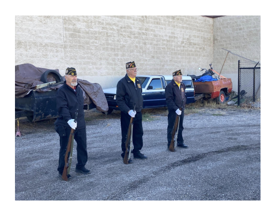
We sure do love our Honor Guard.