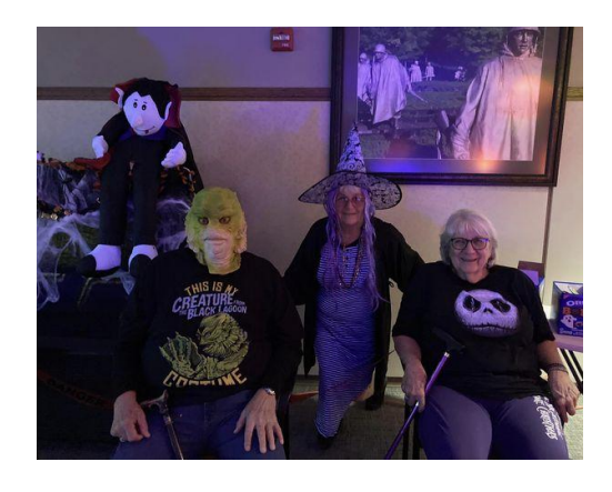
Trick or treating at George E. Wahlen Veterans Home.

"Double, double toil and trouble; fire burn and cauldron bubble"