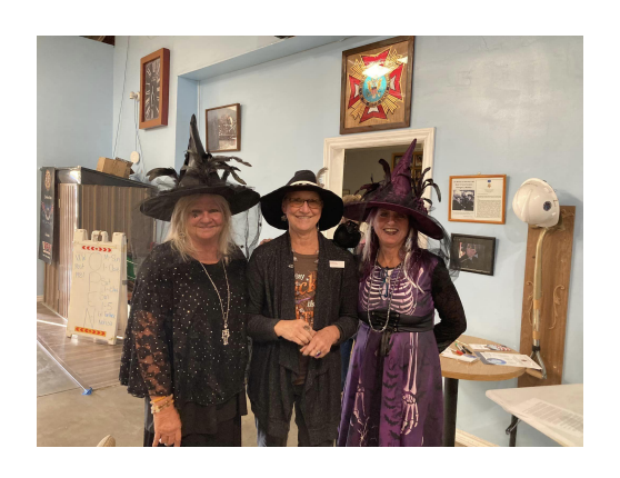
"It is important to remember that we all have magic inside us"